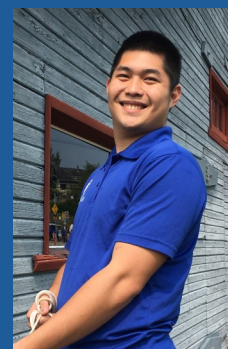
Program & Volunteer Coordinator