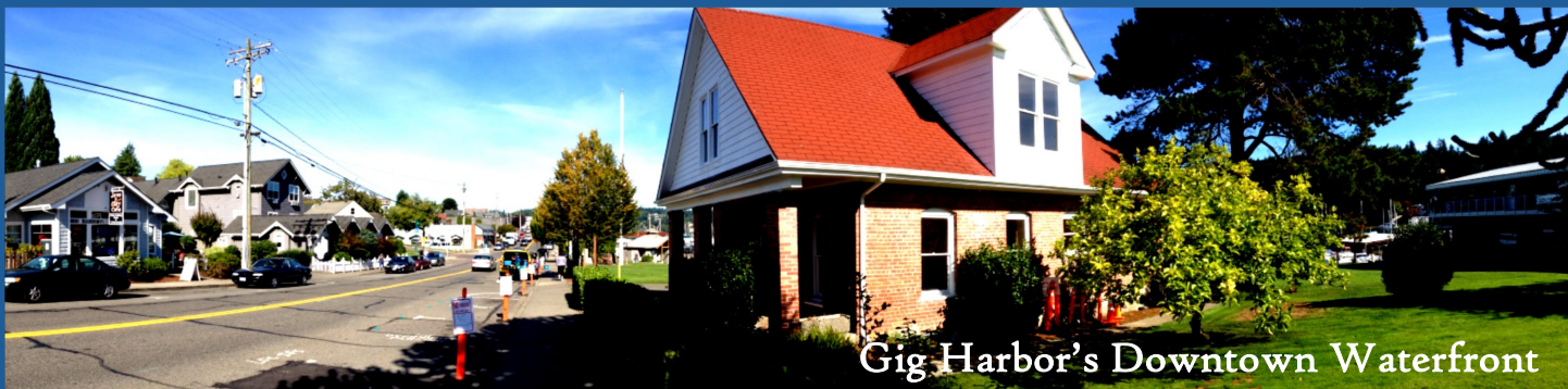
Gig Harbor's Downtown Waterfront

Visit us at the Skansie Visitor Information Center in downtown Gig Harbor — a dynamic destination for residents, visitors and boaters to learn about everything Gig Harbor has to offer.